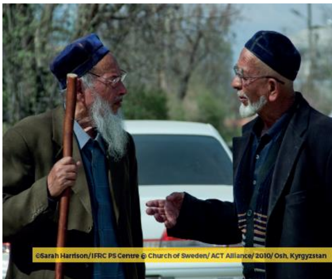
©Sarah Harrison/IFRC PS Centre © Church of Sweden/ ACT Alliance/ 2010/ Osh, Kyrgyzstan

Activities that will support adults' wellbeing during home isolation/quarantine: